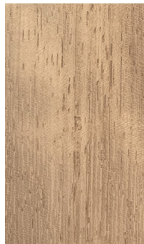
legno_teak / teak_wood