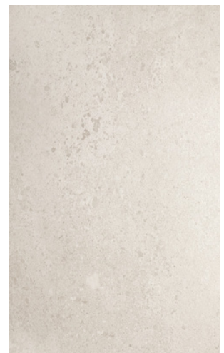
Stone Bianco Lasa